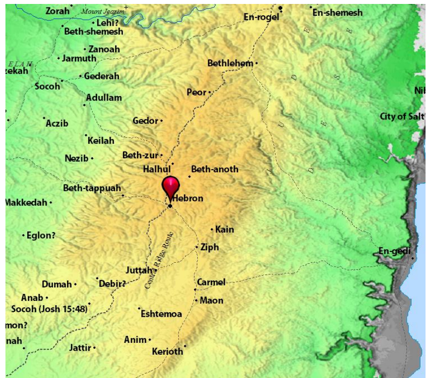
MAP OF JUDEA AND SOUTHERN ISRAEL

1Sa 23:20 Now therefore, O king, come down according to all the desire of your soul to come down; and our part shall be to deliver him into the king's hand."